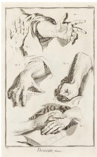
Fig. 6 Anonymous after Benoît Louis Prévost, Arm- und Handstudien , plate from Diderot / D'Alembert, Encyclopédie (edition Livorno 1770–1778), etching.