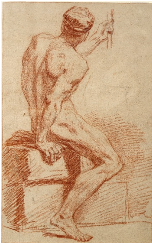
Fig. 11 Charles Parrocel (1688–1752), Aktstudie: Sitzender Mann von hinten , 1st half of the 18th century, red chalk.