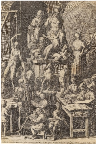
Fig. 4 Cornelis Cort after Jan van der Straet, Die Akademie der schönen Künste , 1578, engraving.