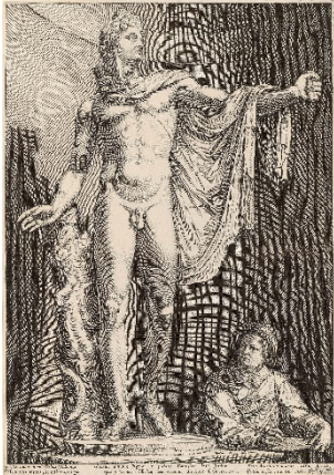
Fig. 10 Hendrick Goltzius (1558–1617), Apollo Belvedere , ca. 1592, engraving.