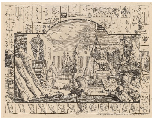
Fig. 5 William Hogarth, Der Statuenhof , from: The Analysis of Beauty , 1753, etching